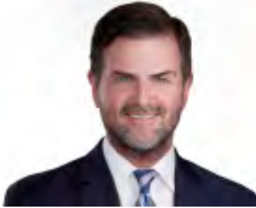
Brandon Creighton Texas Senate District 4